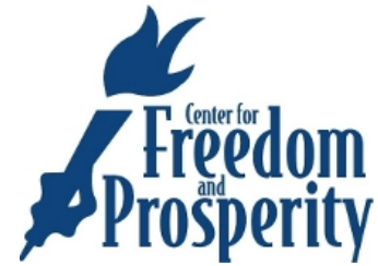
Center for Freedom and Prosperity