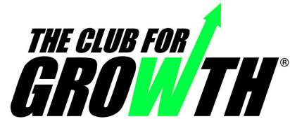
Club for Growth