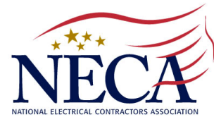
National Electrical Contractors Association