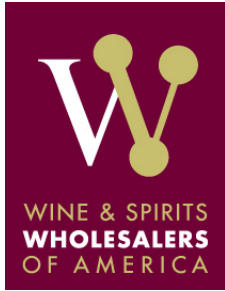
Wine & Spirit Wholesalers of America