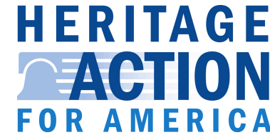
Heritage Action for America