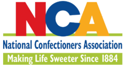
National Confectioners Association