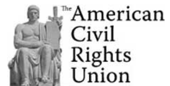
American Civil Rights Union