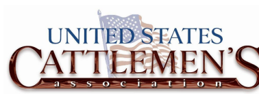
United States Cattlemen's Association