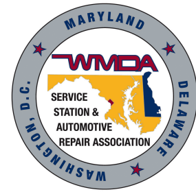
WADA Service Station & Automotive Repair Association